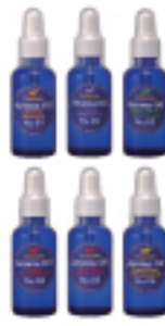
A total of 6 types of Pet Esthé Aromatic Oils