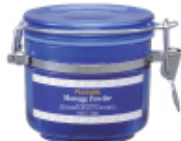
Pet Esthé Massage Powder