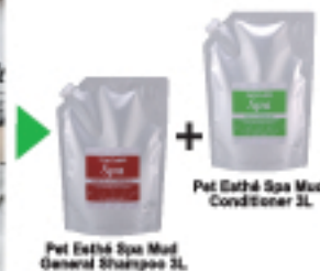
Pet Esthé Spa Mud General Shampoo 3L