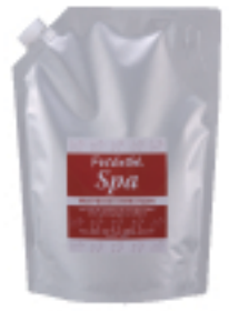
Pet Esthé Spa Mud General Shampoo